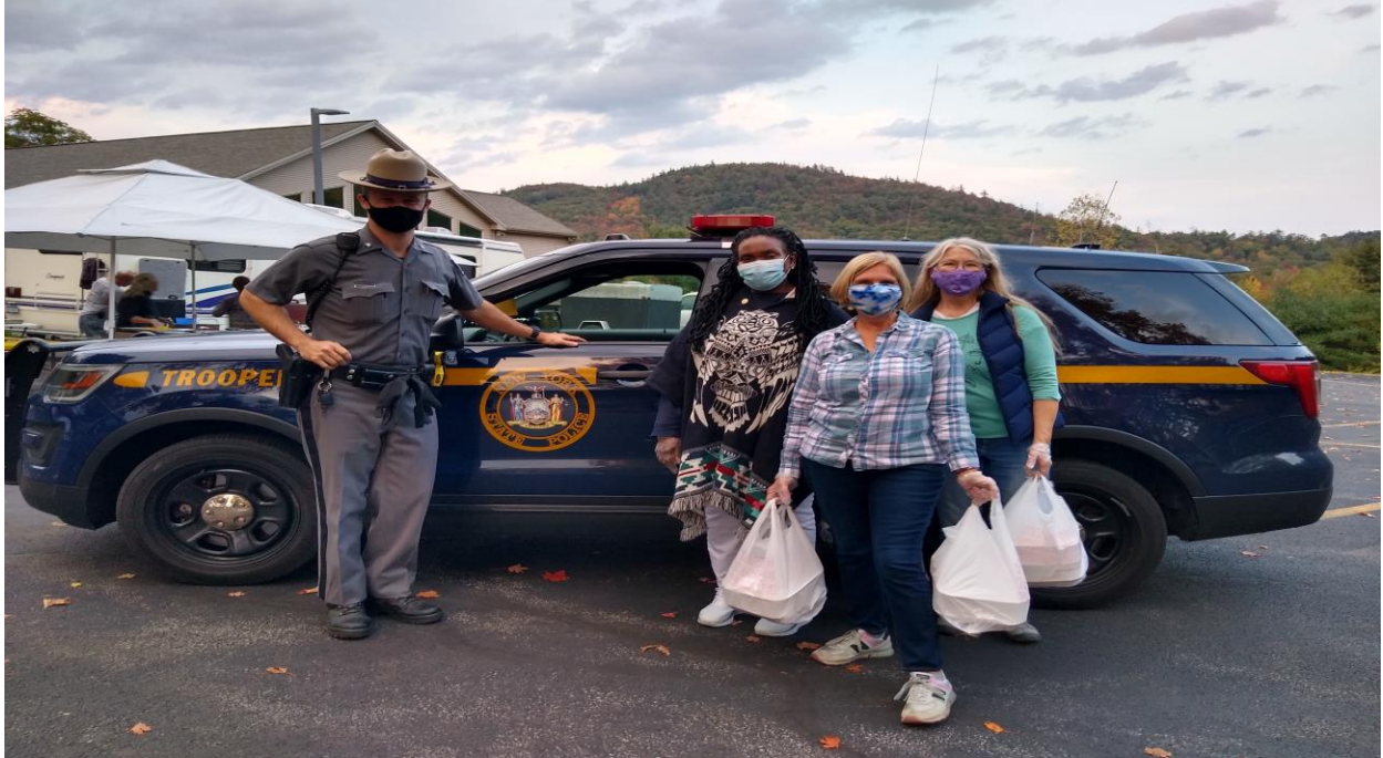
Thank you, NYS Troopers for all that you do!