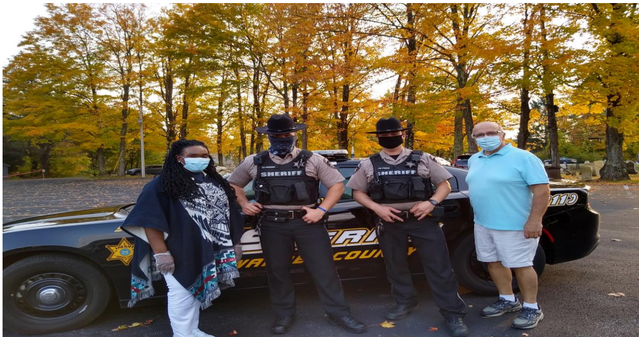
Thank you, Warren County Sheriff's Department! We appreciate you!